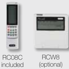
RC08C included RCW8 (optional)